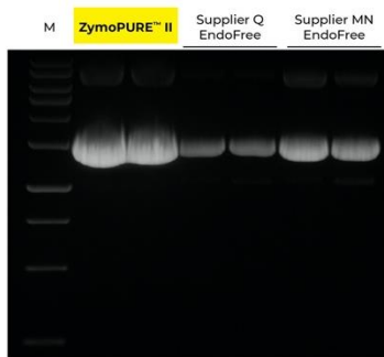
Up to 6x More Concentrated Plasmid